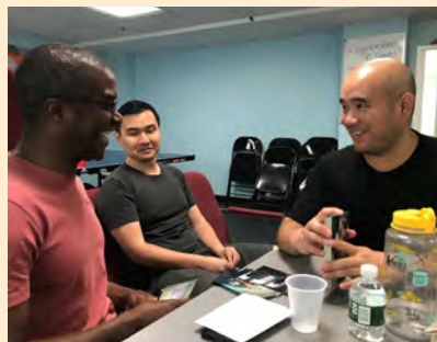
Adult Education Reunion