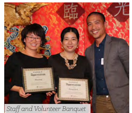
Staff and Volunteer Banquet