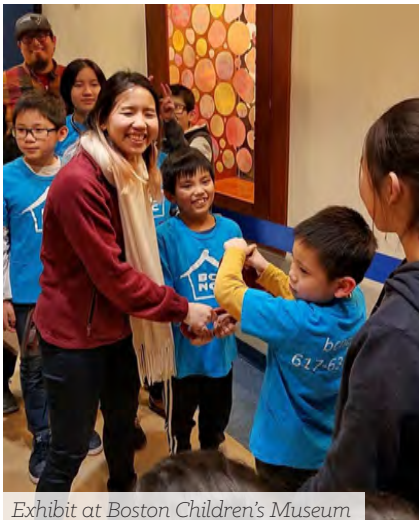
Exhibit at Boston Children's Museum