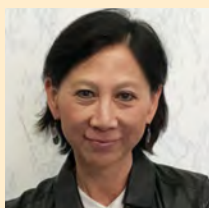
Pao Arts Center 2018-2019 Artist-in-Residence: