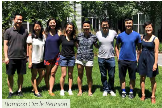
Bamboo Circle Reunion