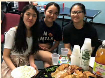
Youth and Recreation Reunion